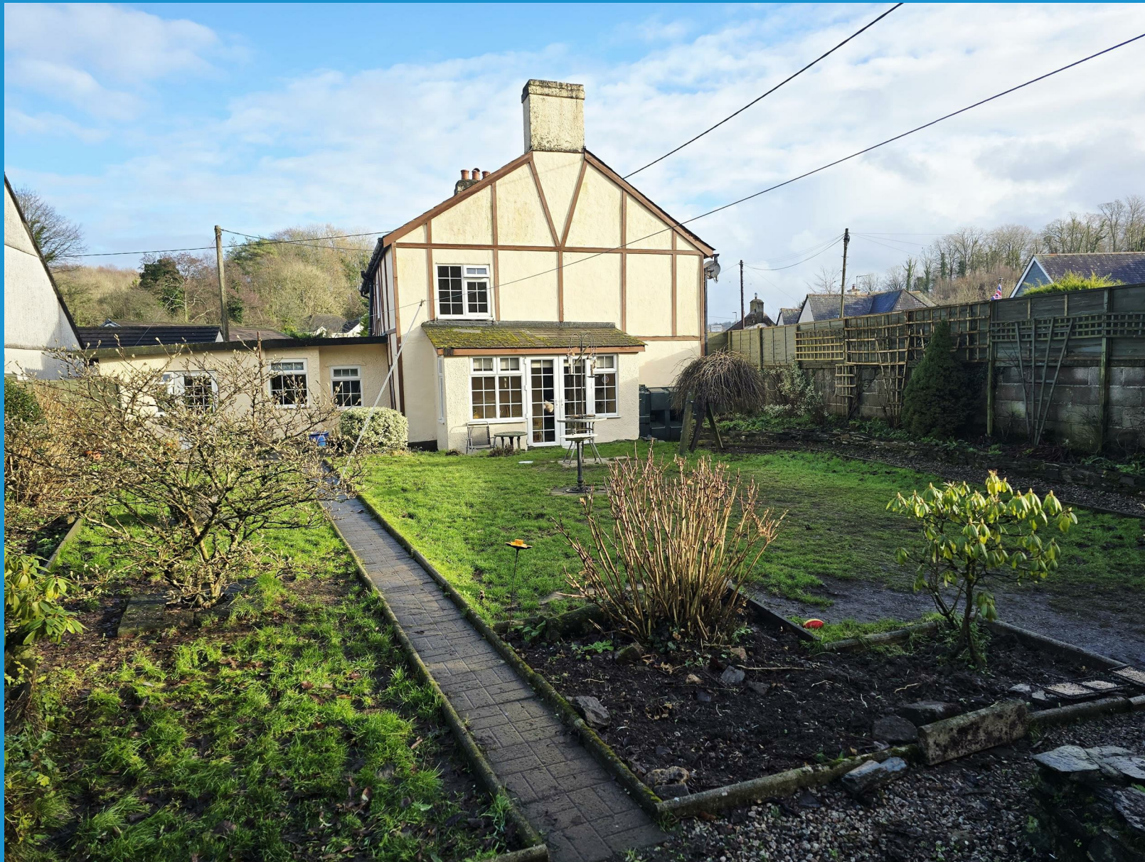
Ivy Cottage Tinhay | Lifton